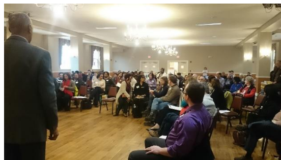
Members of the Parish meet for the Town Hall

You, the parishioners, provided feedback to the leadership of St. Michael the Archangel in several key ways. First, members of the parish were invited to participate in a survey to indicate your thoughts and concerns. Then, parishioners were invited to a Town Hall meeting to review findings from the survey and